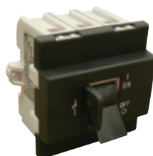
Special Black Toggle Handle Motor Disconnect Switch EVA3100 + K/EVAB