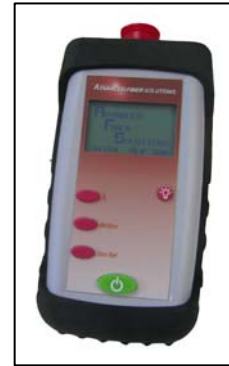
AF-OM100 Series Power Meter

All of the Advanced Fiber Solutions power meters are the perfect tools for measuring optical power, loss (attenuation) and optical return loss in any system, it is just a matter of picking the right instrument for the application. All meters are calibrated at industry standard wavelengths (NIST traceable) for both single-mode and multimode transmitters. All detectors are potted in a threaded housing for versatility and allows the user to interchange adapters for numerous connector types. The AF-OM100A series meters are a low cost series of power meters for the technician who wants a high performance meter. All power meters now come with protective rubber boot.