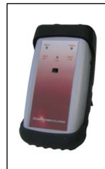
OS400 Series Power Meter

The AF-OS400 series sources offer a complete line of sources for any testing application. Whether testing outside plant or premise an AF-OS400 series optical source will be perfect when combined with an AF-OM100 series optical power meter. On each source all wavelengths are individually adjustable allowing the user to use less battery power when high optical output power is not necessary, or to turn up the power to test long runs. This also makes it possible for the AF-OS420 LED source to test single-mode cables up to 5km at 1300nm.