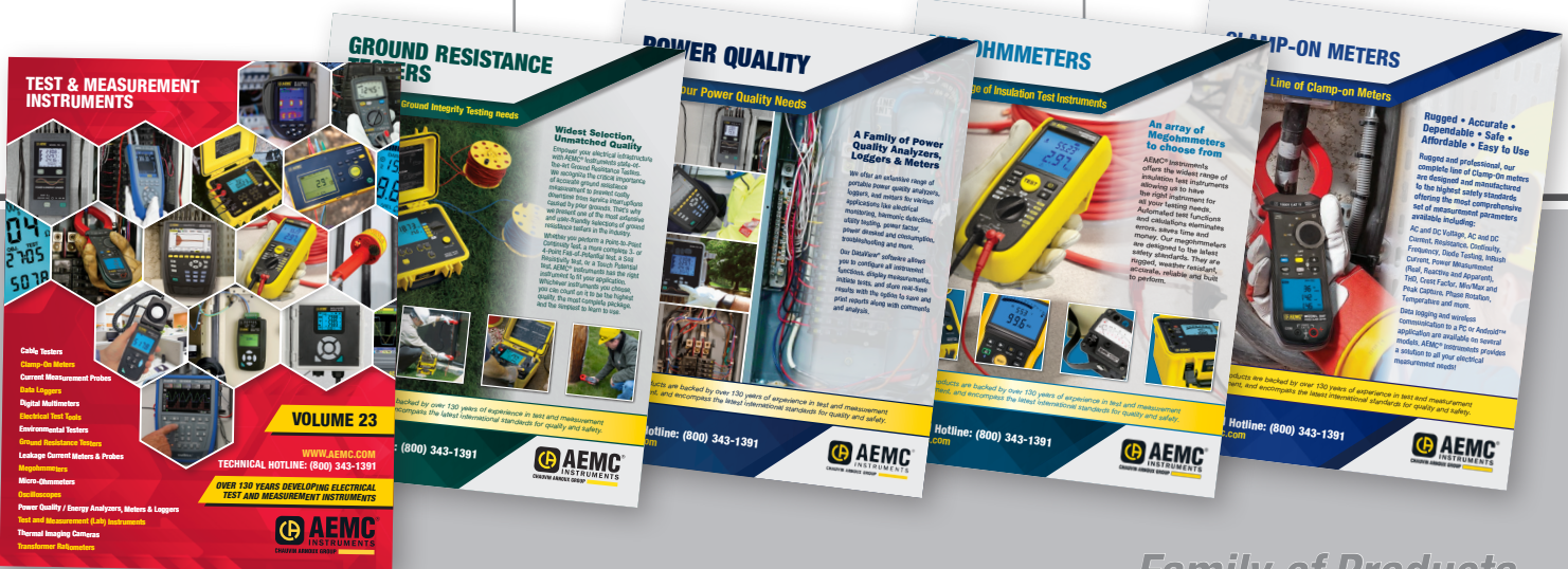
Family of Products

Chauvin Arnoux ® 12-16 Rue Sarah Bernhardt 92600 Asnières-Sur-Seine, FR Tel +1 33 1 44 85 45 85 Fax +1 33 1 46 27 73 89 info@chauvin-arnoux.com www.chauvin-arnoux.com