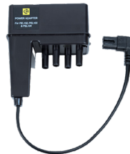
ADAPTER - 600 V CAT III POWER TO PHASE ADAPTER FOR USE WITH MODELS PEL 102 & PEL 103

Our range of accessories cover a spectrum of applications, from multimeters and oscilloscope probes to power analyzers and thermal imaging cameras. Plus, our accessories are engineered with the highest industry standards, ensuring that you can conduct tests confidently, knowing that you and your equipment are protected. No matter the complexity of your electrical setup, we've got the right tool and accessory to streamline your testing processes. All accessories are available on our website!