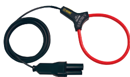
MINIFLEX® SENSOR MODEL MA193-10-BK FOR MODELS 3945-B, 8220, 8230, 8333, 8335, 8336, 8345, 8435 & PEL SERIES