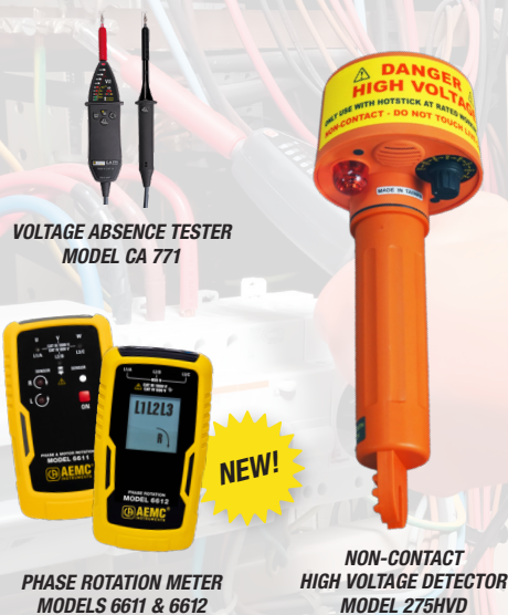
VOLTAGE ABSENCE TESTER MODEL GA 771