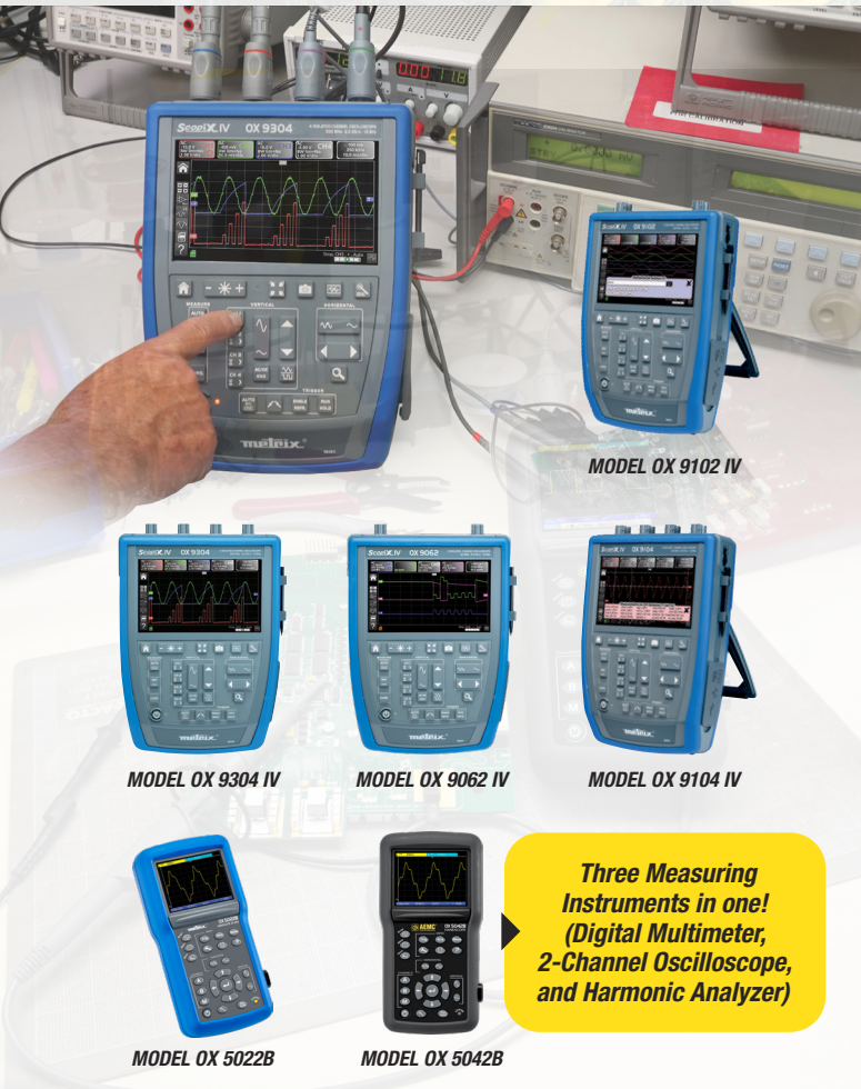
MODEL OX 9102 IV