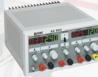
DC POWER SUPPLY MODEL AX503