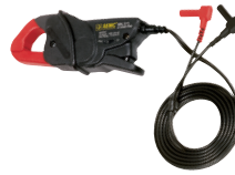
AC CURRENT PROBE MODEL MN373