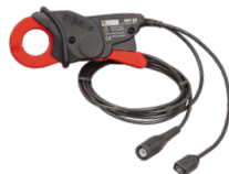
AC/DC CURRENT PROBE MODEL MH60