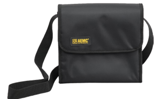
CARRYING POUCH FOR CABLE TESTERS, MEGOHMMETERS, MULTIMETERS, ETC.