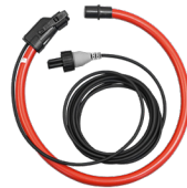
AMPFLEX® SENSOR MODEL 196A-24-BK FOR MODELS 8435, 8436 & PEL 105