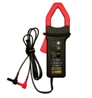
AC/DC CURRENT PROBE MODEL MR526 (BANANA CONNECTOR)