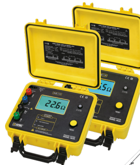
MODELS 4620 AND 4630

Our revolutionary Clamp-On Ground Resistance Testers will save you time and money with the ability to measure resistance without disconnecting the ground system!