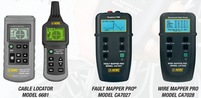
CABLE LOCATOR MODEL 6681