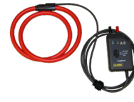
AMPFLEX® FLEXIBLE SENSORS