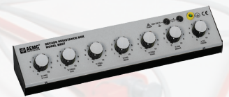
RESISTANCE DECADE BOX MODEL BR07