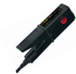
AC CURRENT PROBE MODEL MN01