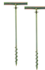
17" STAINLESS STEEL T-SHAPED AUXILIARY GROUND ELECTRODES