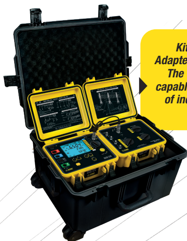
GROUND FLEX® FIELD KIT MODEL 6474

Kit includes the GroundFlex® Adapter Model 6474 and Model 6472. The ONLY system on the market capable of testing ground resistance of individual power transmission tower legs!