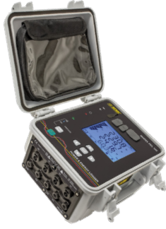
POWER & ENERGY LOGGER MODEL PEL 105