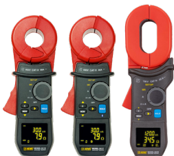
MODELS 6416, 6417, 6418