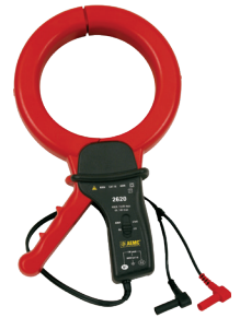
LEAKAGE CURRENT PROBE MODEL 2620