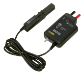
DC/AC MICROPROBE MODEL K110