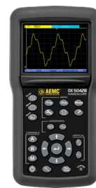
MODEL OX 5042B

Three Measuring Instruments in one! (Digital Multimeter, 2-Channel Oscilloscope, and Harmonic Analyzer)