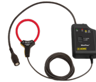
MINIFLEX® FLEXIBLE SENSORS