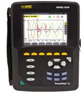
POWERPAD® MODEL 8336