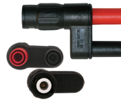
ADAPTER - BANANA (FEMALE) - BNC (MALE) (XM-BB) FOR USE WITH AMPFLEX SENSORS, MODELS K100/K110 AND SLII DATA LOGGERS