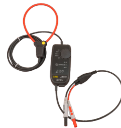
MINIFLEX® 14" MODEL MA114

We offer custom probes to meet your application. Just let us know your specific needs! To get started, go to our website www.aemc.com , click on the Support tab and fill out the Customer Service form.