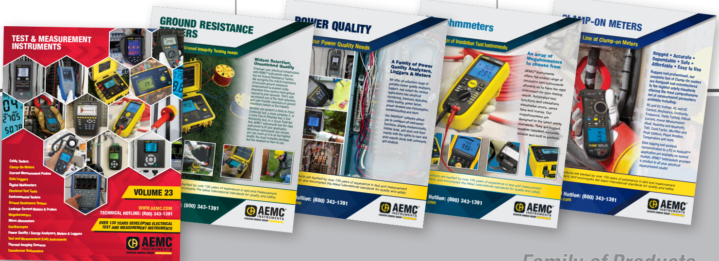
Family of Products

12-16 Rue Sarah Bernhardt 92600 Asnières-Sur-Seine, FR Tel +1 33 1 44 85 45 85 Fax +1 33 1 46 27 73 89 info@chauvin-arnoux.com www.chauvin-arnoux.com