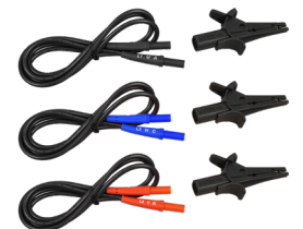
REPLACEMENT LEADS WITH CLIPS FOR MODELS 6608 & 6609