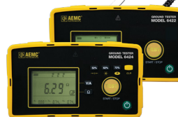
MODELS 6422 AND 6424