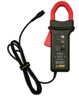
AC/DC CURRENT PROBE MODEL MR417 (BNC CONNECTOR)