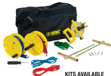
KITS AVAILABLE SHOWN: CATALOG #2135.35