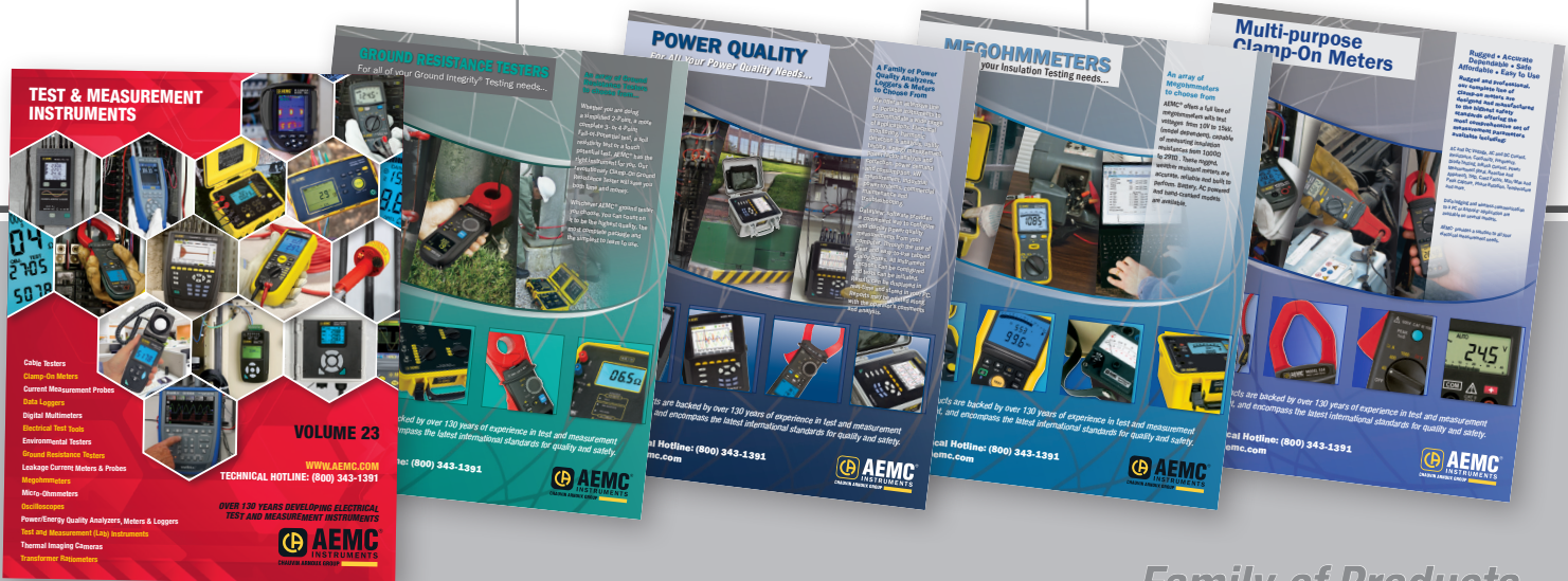
Family of Products

Chauvin Arnoux® 12-16 Rue Sarah Bernhardt 92600 Asnières-Sur-Seine, FR Tel +1 33 1 44 85 45 85 Fax +1 33 1 46 27 73 89 info@chauvin-arnoux.com www.chauvin-arnoux.com