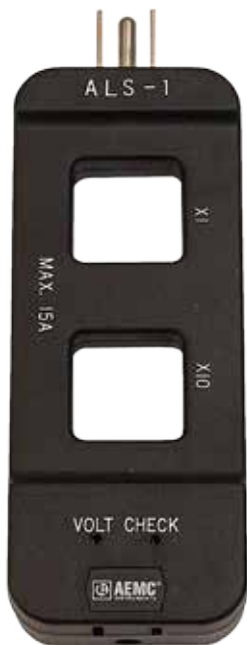
AC Line Splitter Model ALS-1 Cat. #2121.05