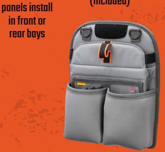
Laptop/Tablet Panel (sold separately)