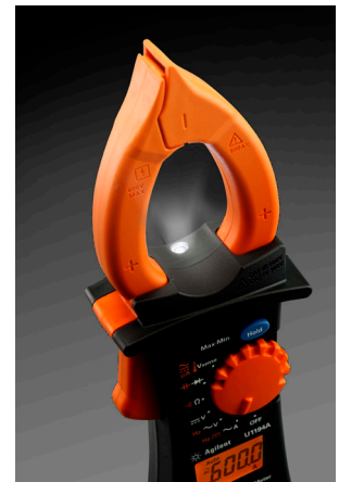
Figure 2. Built-in LED flashlight to illuminate test area