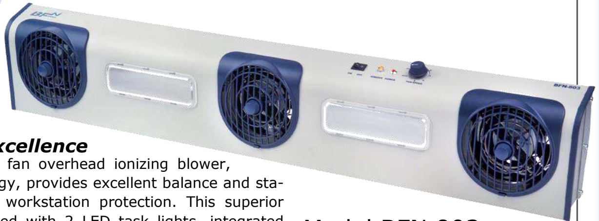
Model BFN 803 AC Overhead Ionizer