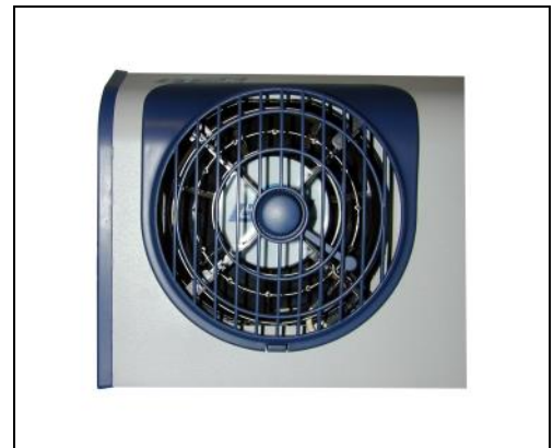
Removable fan plate with safety switch and point cleaner.