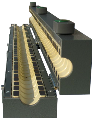
KEMA 801B, side view

The KEMA 801B is recommended as an additional decoupling network (ferrite tube clamp) for immunity test according to IEC / EN 61000-4-6 when using the clamp injection method. It shall be inserted on all the cables between EUT and AE except the cable under test. The KEMA 801B prevents, that the test signal applied to the EUT affects other devices, equipment or systems, which are not under test and improves the reproducibility of the test results.