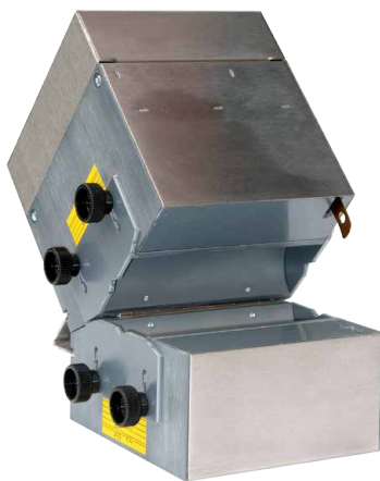
CVP 2200A, opened

The Capacitive Voltage Probe (CVP) is designed for measuring asymmetrical disturbances on cables with capacitive coupling principle. It gives the opportunity to do the measuring without disconnection of the tested cable ("in-situ") and it avoids the influence of the transmission. Main parameter of the CVP is the coupling factor, measured in a calibration system with 50 Ω impedance. The capacitive voltage probe is specified in chapter 5.2.2 and Annex G of CISPR 16-1-2.