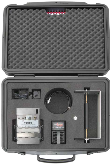
CVP 2200A, power supply, battery charger, calibration jig, RF cable and 50 Ω termination in suitcase