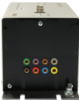
CDN A801, view to the EUT port