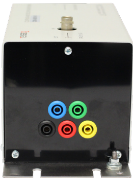
CDN A501, view to the EUT port