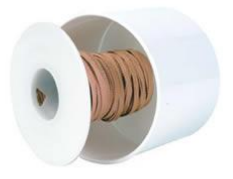
1808-5F Pro Wick White #1 Braid - AS 25 units/case