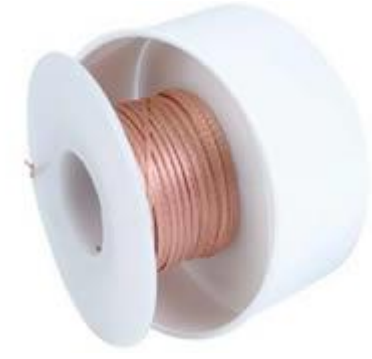
1804-10F Pro Wick Blue #4 Braid 10' 25 units/case