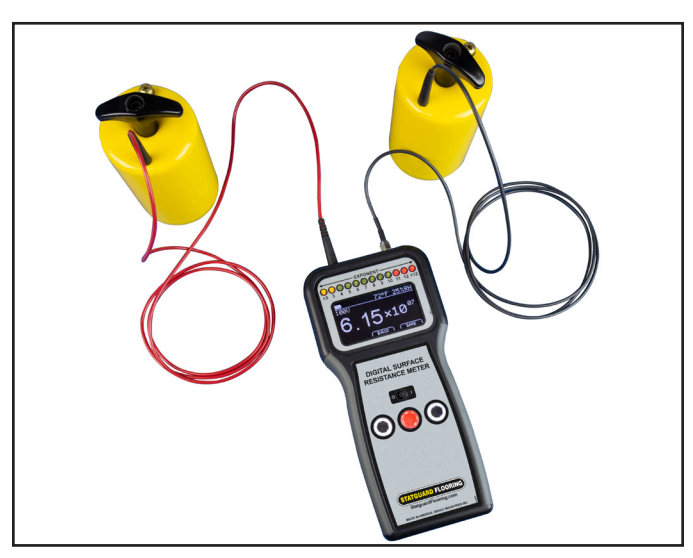
Figure 5. <u>D19290</u> Statguard Flooring Surface Resistance Meter Kit

Test the surface resistance point to point (Rtt or Rtg), and resistance-to-ground (Rtg or Rg) properties of coated area per ANSI/ESD S7.1 or Compliance Verification ESD TR53 at initial installation and quarterly. For quick and easy verification of the coating, we recommend using a Statguard Flooring Surface Resistance Test Meter Kit.