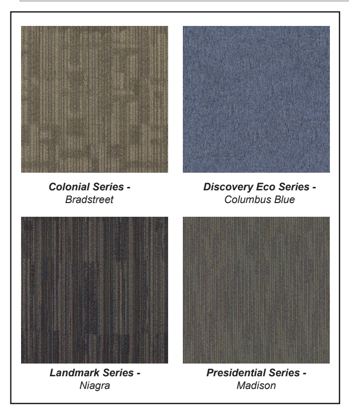
Figure 1. ESD Modular Carpet Tile

Note: The following instructions should be reviewed prior to installation. Every effort has been made to provide accurate and reliable information in this quideline. This is only intended as a guide for our customer's use with our recommended tools and materials. Statguard Flooring can not accept any responsibility for loss or damage that may result from the use of this information, due to the possibility of variations of processing or working conditions and/or workmanship beyond our control. End user customers are advised to conduct their own tests for a particular application. We strongly recommend using a licensed and experienced ooring installer to ensure satisfactory results.