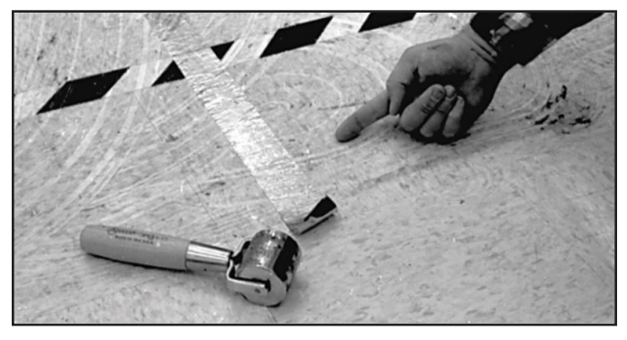
Figure 2. Grounding Strips Installation

Trowel Notch Size: Statguard Flooring recommends using a 1/16" x 1-16" U notch trowel. Floor should have full coverage of adhesive for proper bonding of carpet tiles. Allow adhesive to dry fully before moving to next step- adhesive should be tacky when dry. (To make sure adhesive is fully dry/tacky, the adhesive should not transfer to your finger when touched.)