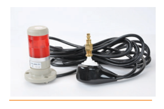
Adjustable Airline Monitor