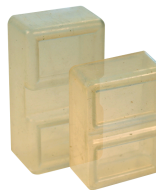
Rubber Boot for Twin Actuators Color: Clear Cat. No. 2ATBT7 (Non-Illuminated) 2ATLBT7 (illuminated)