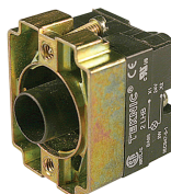
Bulb Holder for Illuminated Push Buttons Cat. No. 2LHB