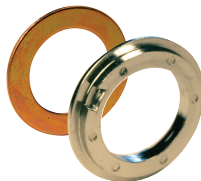
Adapter for installing a Ø22.5 device in Ø 30.5 cutout Cat. No. 2ADP (with washer) ADW (washer only)