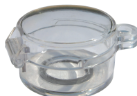
Plastic Cover Cat. No. 2PAM7