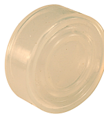
Transparent Silicone Rubber Boot for Flush Actuators Color: Clear Cat. No. 2BT7 (for non-illuminated) 2ALBT7 (for illuminated)