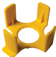
E-Stop Shroud Plastic protector: Cat. No. 2ESS1 Plastic protector (UL): Cat. No. 2ESS1-UL