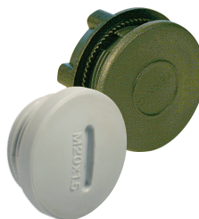
Blanking plug for 22.5 mm holes Color: Black Cat. No. 2BP2 Blanking plug for M20 (20mm) or NPT 1/2" holes Color: Gray Cat. No. M20 Cat. No. NPT1/2