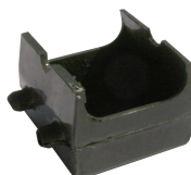
Rubber Boot for Contact Elements Cat. No. 2SEBT2