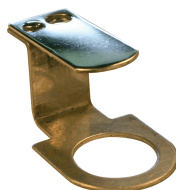
Padlock For mushroom actuator: Cat. No. 2PAM For projecting actuator: Cat. No. 2PAP