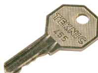
Replacement Keys For all 22mm operators wth keys Cat. No. 2KY455