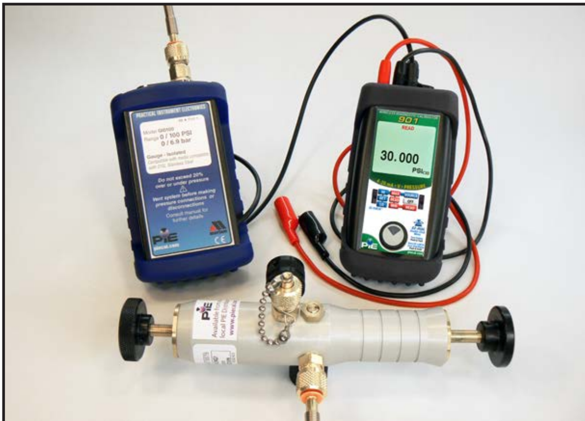
PIE 901 with Optional Pressure Module, Pressure/Vacuum Pump & Hose

PSI • inches, feet, mm, cm and meter of H2O @ 4°C, 20°C & 60°F • inches, meter, cm and mm of Hg @ 0°C; torr • kg/cm2 • kg/m2 • Pa • hPa • kPa • MPa • Bar • mBar • ATM • oz/in2 • lb/ft2