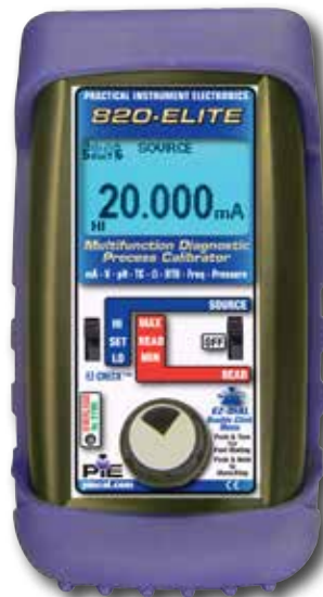
820-ELITE Multifunction Standard Process Calibrator

Source & Read mV, V dc plus percent of 1 to 5 volts plus Simulate pH