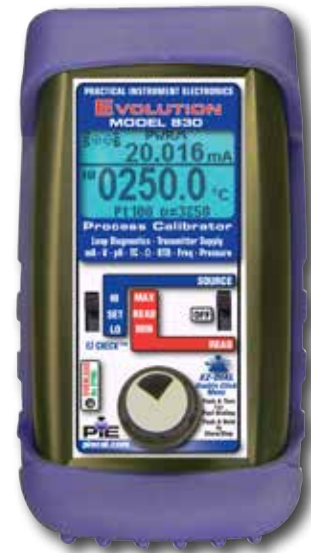
830 Process Calibrator

Source & Read mA, V, Thermocouple, Ohms, RTD & Frequency plus Simulate pH and measure pressure with optional modules