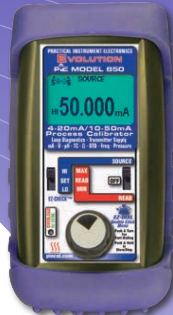
Model 850 4-20 / 10-50 mA Multifunction Calibrator

The 2-Wire transmitter simulator function of the PIE Models 535 & 850 operate with loop voltages from 2 to 90 V dc where the competitive models are rated for 5 to 60 V dc. If the competitive calibrators are connected to a loop with an older power supply with greater than 60 V dc they will blow an internal fuse.