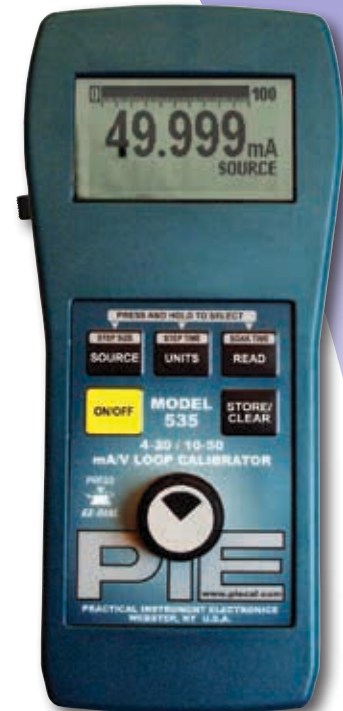
Model 535 4-20 / 10-50 mA and Voltage Calibrator