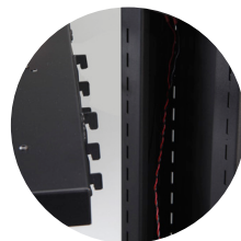
Slotted support mast for adjustable shelves