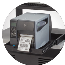
Optional printer shelf