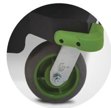
Specialized casters make cart movements smooth and easy

All PC Series Mobile Powered Workstations listed below come standard with (one) adjustable height shelf, 6" locking casters, push handles, integrated power system and power strip, waste basket and holder.