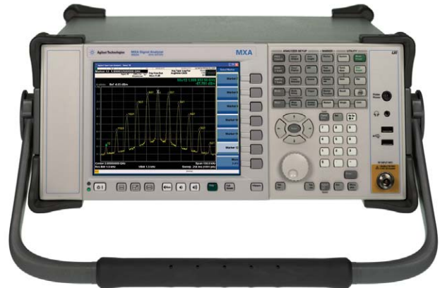
Portable configuration includes pivoting carrying handle and protective corner rubber guards (front protective cover comes standard) – N9020A-PRC