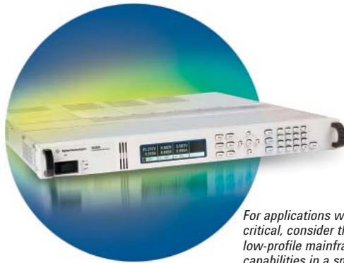
For applications where space is critical, consider the Agilent N6700 low-profile mainframes with similar capabilities in a small 1U footprint.