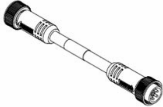
Series image - Reference only

Status: Active Series: 130010 Category: Molex Parts Engineering/Old PN: 113020A01F0601