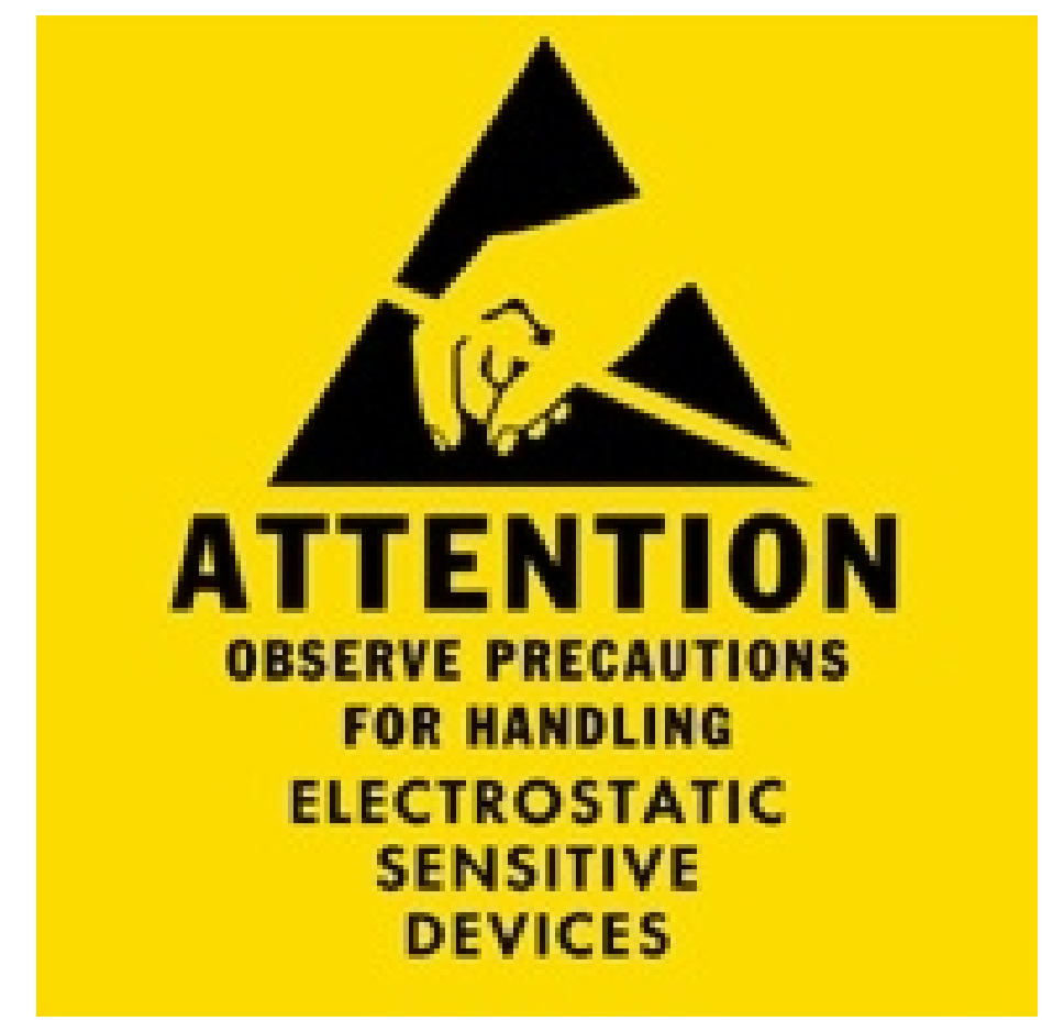
DETAIL A 45MM X 45MM