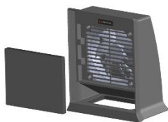
1. Add Filter