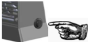
3. Power On