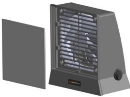
1. Add Filter