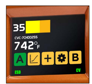
Tip temperature displayed on large color screen.