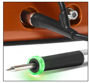
LED equipped hand piece signals to operator when a good solder joint is formed.