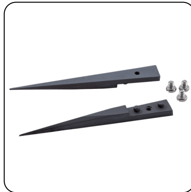
Replacement Tips Only: 73-ZJK-RT Kit of 2 Ceramic Tips and 3 screws

Unless otherwise noted, tolerance is \pm 10\% .