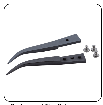
Replacement Tips Only: 7-ZJK-RT