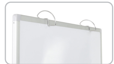
Hold easel paper pads and pocket charts

2245 Delany Road, Waukegan, IL 60087 800-323-4656 | Fax 847-244-1818 | www.LuxorFurn.com