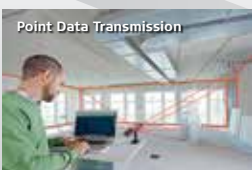
Point Data Transmission