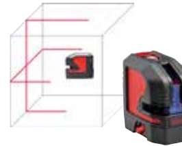
Leica Lino L2 Part # 864413

The Leica Lino P5 point laser is very easy to use. At the push of a button, it accurately projects five reference points at exact right angles to one another.