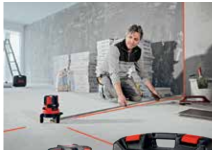
Leica Lino L4P1 pack Part # 834838 the most powerful multi line laser

The Leica Lino L4P1 is our latest and most powerful multi line laser, which supports efficient and quick workflows for dry wall installers, tilers and many other interior trades. Its innovative and unique power concept and its versatility makes it the first choice.