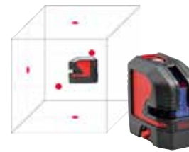
Leica Lino P5 Part # 864427

The Leica Lino P5 point laser is very easy to use. At the push of a button, it accurately projects five reference points at exact right angles to one another.