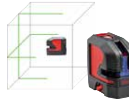
Leica Lino L2G Part # 864420

The Leica Lino L2P5 is a self-levelling cross-line and point laser. This Lino is ideal for alignment tasks such as tiling, drywalling, partitioning and electrical installations as well as plumb point projection, setting out or transferring measured points.