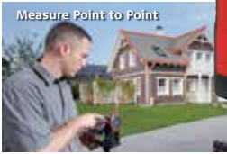
Measure Point to Point