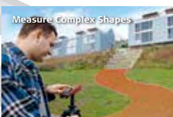
Measure Complex Shapes