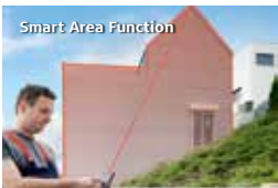
Smart Area Function