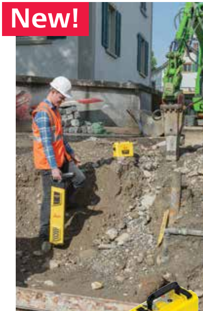
Leica DA220 Signal Transmitter

The Leica DD SMART utility locators and DX Shield software open the door to a connected world, anywhere, anytime. Leica DD SMART utility locators detect underground assets deeper, faster and more accurately. The DD SMART utility locators are scalable and designed with onboard memory, GPS and Bluetooth technology. Connect and download data stored in the DD SMART utility locators' internal memory, including GPS positioning and transfer it back to the DX Shield software for analysis.