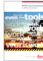
PROTECT by Leica Geosystems Brochure