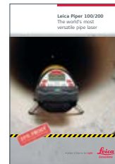
Leica Piper 100/200 Brochure