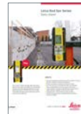
Leica Rod Eye Series Data sheet