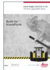
Leica Rugby CLA/CLH/CLI Brochure

Illustrations, descriptions and technical data are not binding. All rights reserved. Printed in Switzerland - Copyright Leica Geosystems AG, Heerbrugg, Switzerland, 2018. 812719en - 08.18