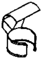
Small Defector Adapter Cat. No. 46-941

The following adapters are recommended for the IDEAL Heat Elite Heat Guns: