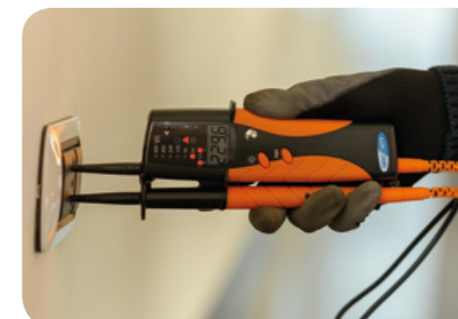
Multimeter function with display and LED indication.