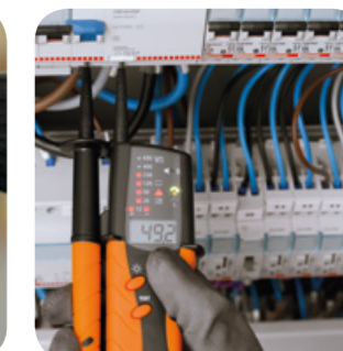
Measurement of phase sequence.