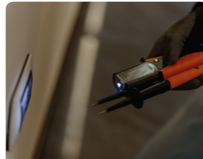
Use of the integrated LED torch.

HT10, HT8, HT7 and HT6 are designed to carry out the measurements of a digital tester in a practical, quick and functional way thanks to their narrow and long structure, which allows carrying out measurements in any operating conditions. These devices carry out measurements of AC/DC voltage with polarity indication , continuity tests with buzzer and phase sequence detection with LED indications and Display reading . In addition HT8 and HT6 carry out diode tests, while HT10 and HT7 carry out measurements of AC voltage with low input impedance. HT10 performs RCD 30mA testing as well. All meters are provided with a white LED torch for use in poorly lit environments, and comply with safety requirements of standards IEC/EN61243-3:2014/VDE 0682 ensuring safe and reliable working conditions. The instruments indicate whether a dangerous voltage is present, even if there is no battery power supply or a failure of the main circuit. The instruments also comply with IEC/EN61010-1 and IEC/61010-2-030 in CAT IV 600V, CAT III 690V (HT10 CAT IV 600V, CAT III 1000V). Protection class IP64 (dust and splash-proof) and molded soft rubber grips make HT10, HT8, HT7 and HT6 heavy duty instruments ideal for the toughest jobs in domestic or industrial applications.