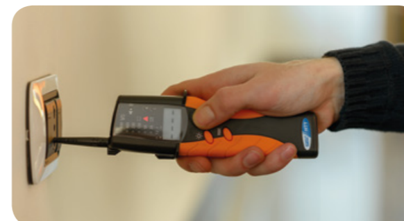
Phase detection function through conductive button.