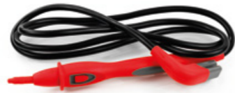
PR701 Remote switch probe for insulation measurements

Professional TRMS multimeter with 10.000 measuring spots and measurement of insulation resistance with selectable test voltage between 50, 100, 250, 500, 1000VDC. HT701 is capable of saving the results of measurements in its internal memory and has been designed in compliance with safety standard IEC/EN61010-1 in CAT III 1000V and CAT IV 600V with double protective insulation.