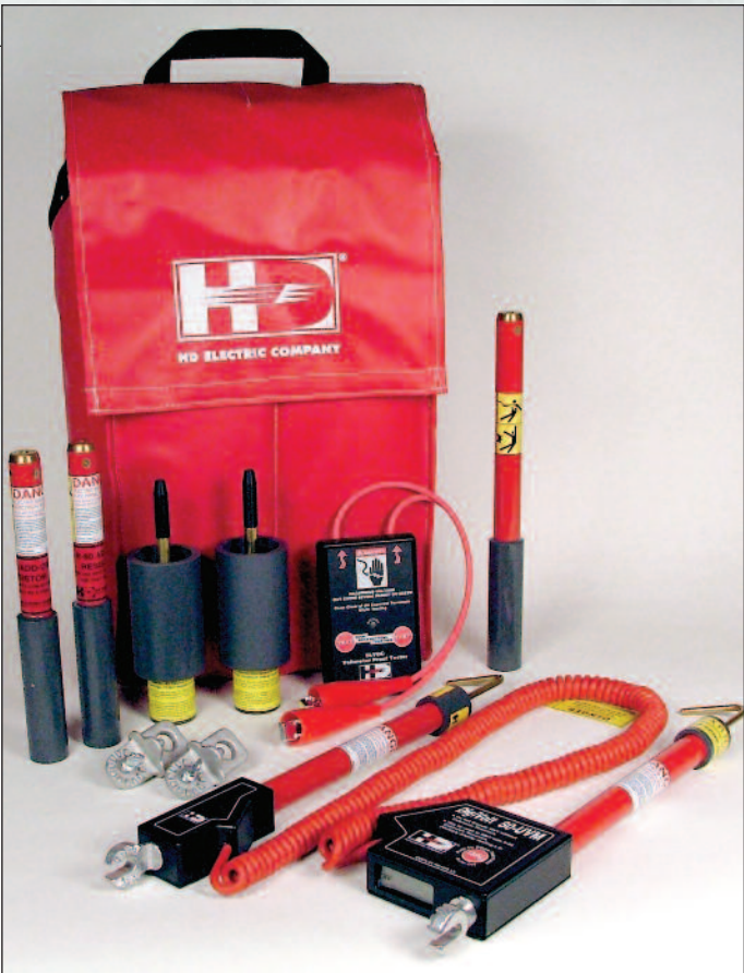
DVM-80UVK Universal Voltmeter Kit

With our experience and dedication to quality and reliability, our reputation speaks for itself. We are confident that you will find our products to be “Best in the Field”® when it comes to detecting, indicating and measuring voltage.