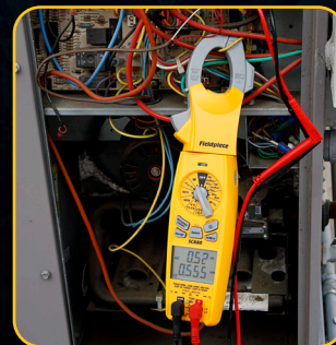
Measures Power (kW)