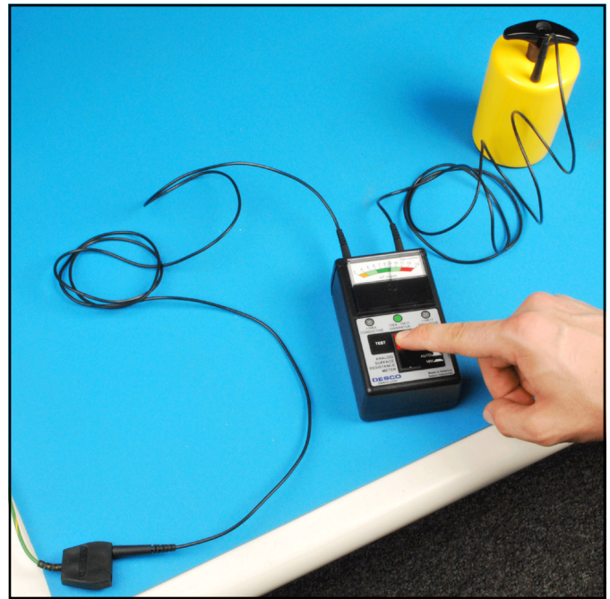
Figure 3. Using the test leads and one 5 pound electrode to measure RTG

CAUTION: If there is a current limiting resistor in the worksurface and the worksurface resistance is lower, the measurement will primarily be the resistance of the resistor. It is recommended to measure RTT particularly if the material color is black.