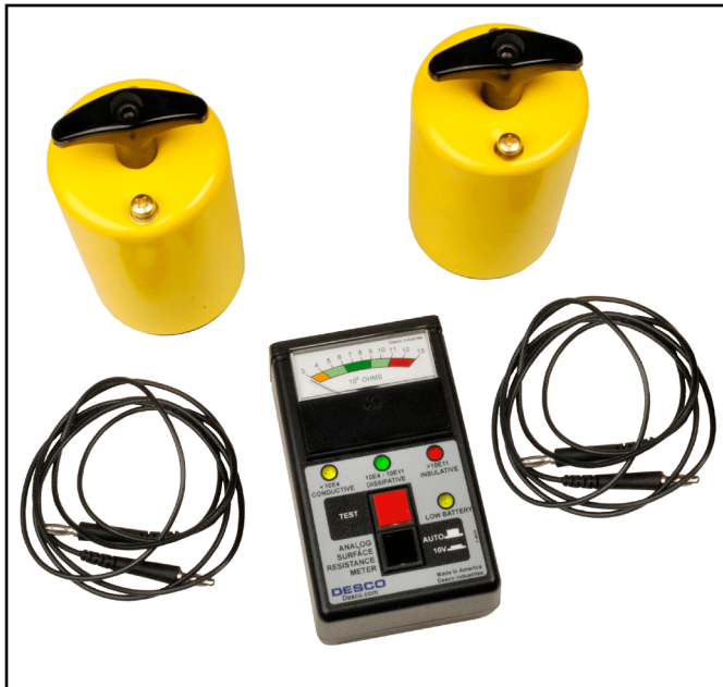
Figure 1. Desco 19784 Analog Surface Resistance Test Kit