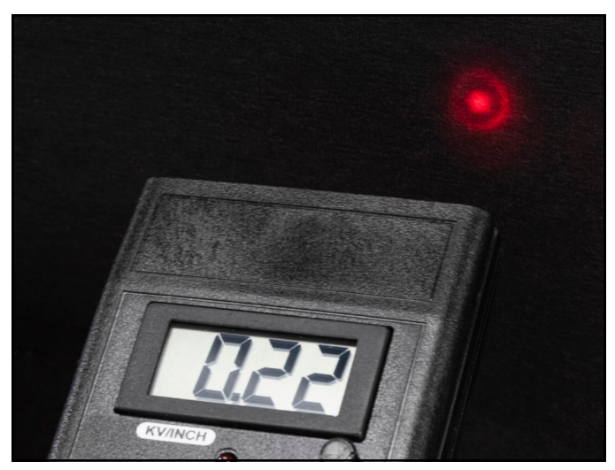
Figure 7. Aligning the two bullseyes emitted by the LED range indicator