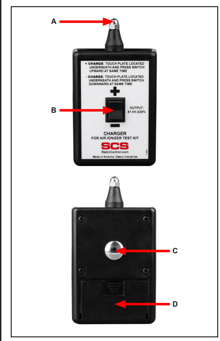
Figure 5. Charger features and components