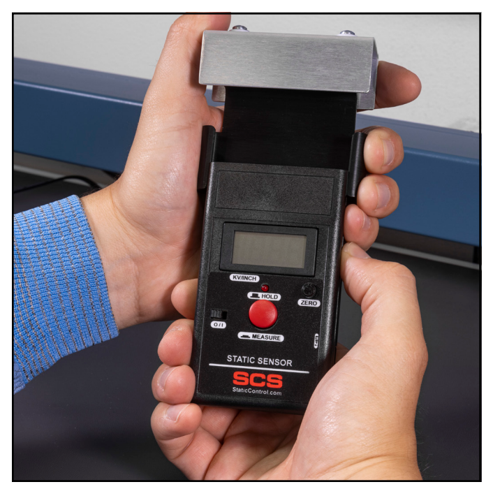
Figure 8. Sliding the Conductive Plate onto the Static Sensor