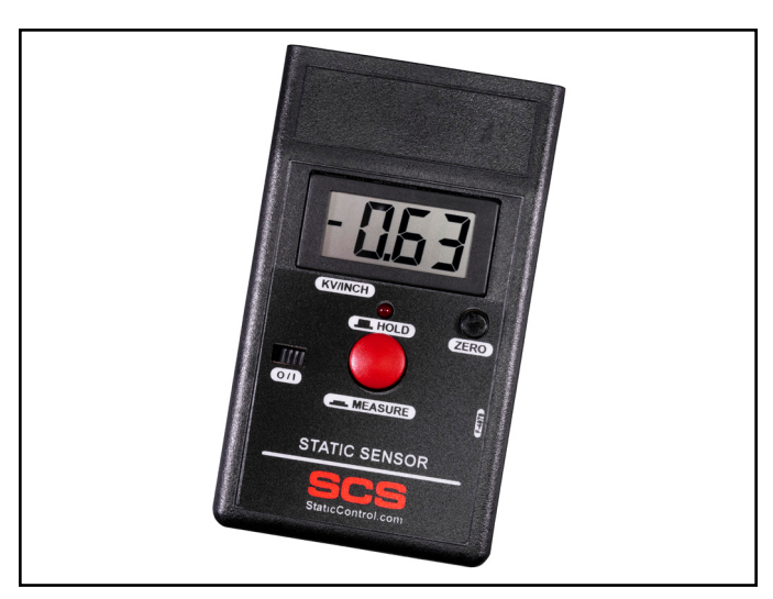
Figure 1. SCS 770716 Static Sensor