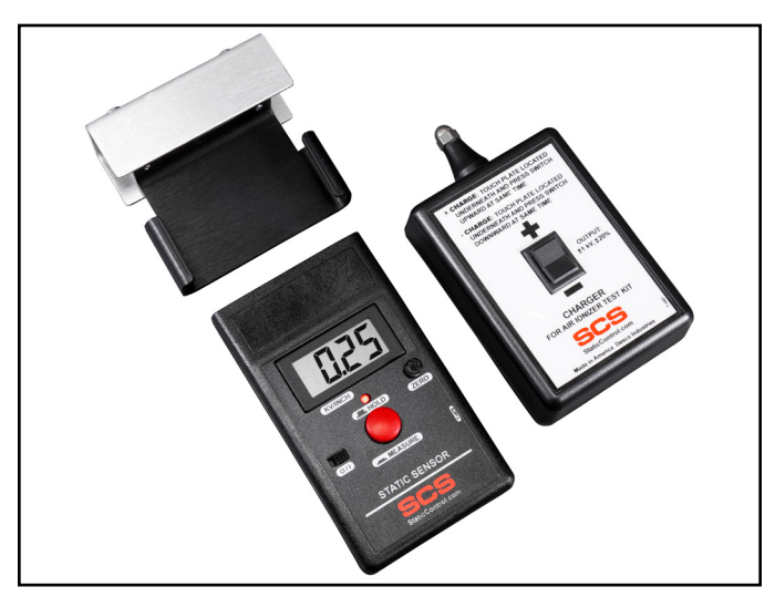
Figure 2. SCS 770717 Air Ionizer Test Kit