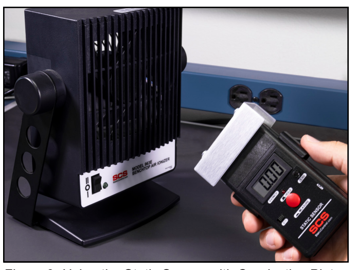
Figure 9. Using the Static Sensor with Conductive Plate to measure the offset voltage of a benchtop ionizer

NOTE: When testing pulsed ionizer systems, the voltage displayed is constantly changing. This pulse rate may be faster than the display update rate of the Static Sensor, therefore the displayed voltage is an average of the actual voltage. The output of the Static Sensor is useful in this situation for more accurate measurements.