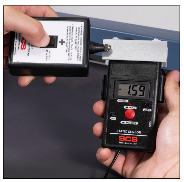
Figure 10. Using the Charger to apply a charge onto the Conductive Plate

NOTE: A ground path must be provided between the touch plate of the Charger and the ground reference of the Static Sensor. This is normally provided by holding the Charger in one hand and the Static Sensor with Conductive Plate in the other.