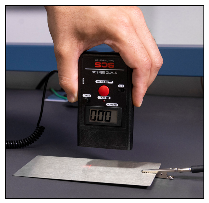
Figure 6. Pointing the Static Sensor to a grounded surface

Slide the power switch to the right to power the Static Sensor. Point the top of the Static Sensor approximately 1 inch (2.5 cm) away from a grounded metal surface. Proper spacing is indicated when the two red bullseyes emitted LED range indicator become centered on top of each other. Turn the rotary zero knob until the Static Sensor's display reads 0.00.