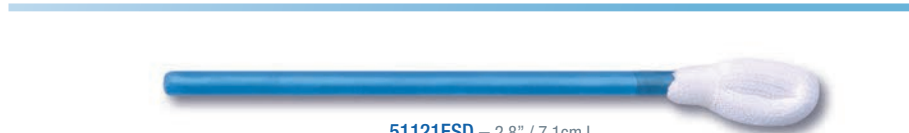
51121ESD – 2.8" / 7.1cm L