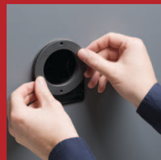
Affix the window

For detailed installation see the UL validated installation instructions supplied with each IR Window.