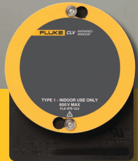
Indoor low voltage