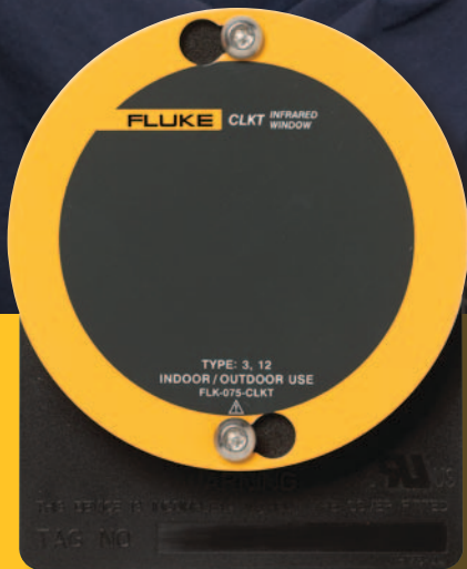
Outdoor/indoor any voltage, arc-tested