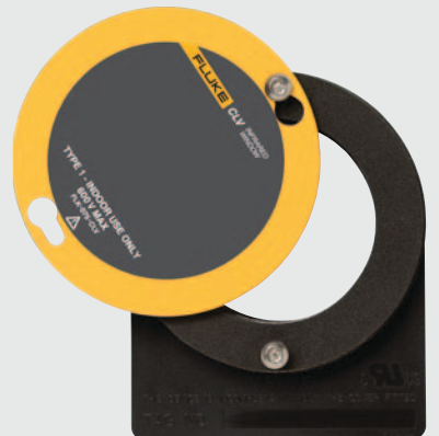
Fluke CLV IR Window for indoor low voltage applications up to 600 V