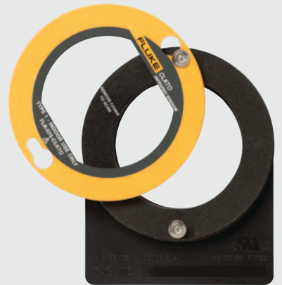
Fluke CLKTO IR Window for indoor medium voltage applications up to 38 kV