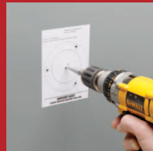
Position with template