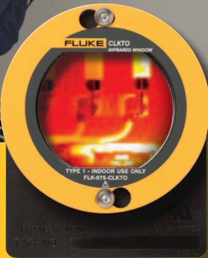
Indoor medium voltage