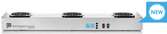
B496203 6.3"H x 37"W x 3.4"D