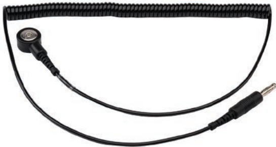
Product# 8107 Premium Wrist Strap Cord