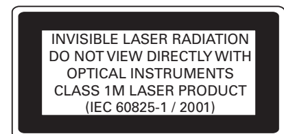
Figure 2. Laser classification label for Class 1M

All laser sources listed above are classified as Class 1M according to IEC 60825 1 (2001). All laser sources comply with 21 CFR 1040.10 except for deviations pursuant to Laser Notice No. 50, dated 2001-July-26.