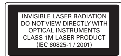
Figure 3. Classification label for 1M lasers

All laser sources comply with 21 CFR 1040.10 except for deviations pursuant to Laser Notice No. 50, dated 2001-July-26.