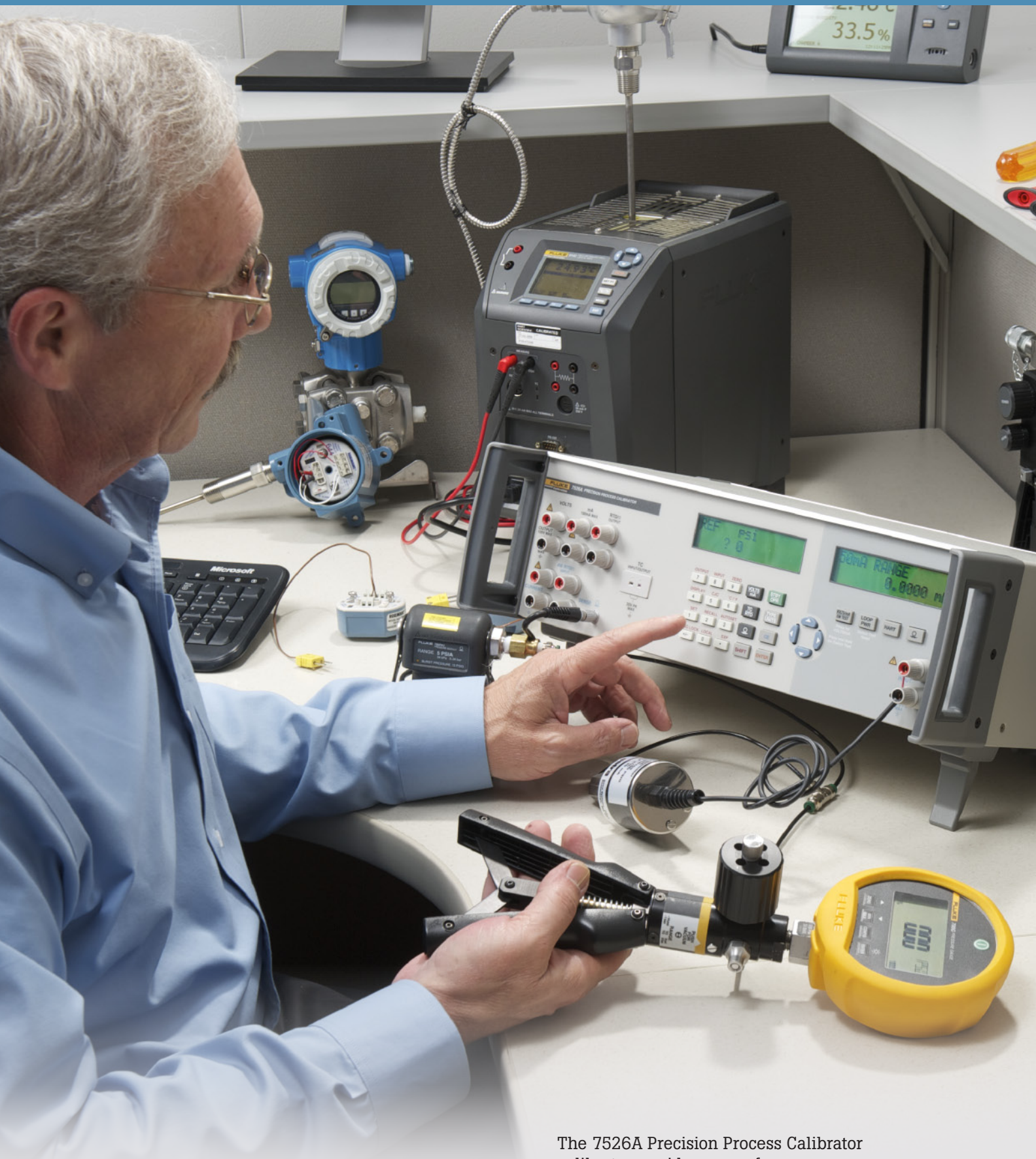
The 7526A Precision Process Calibrator calibrates a wide range of pressure gauges, temperature transmitters, digital process simulators, multimeters and more.