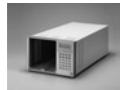
6332: Mainframe for 2 Load modules