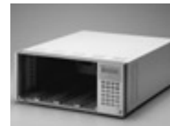
6334: Mainframe for 4 Load modules