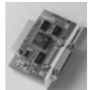
A630002: GPIB Interface