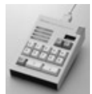
A631001: Remote Controller