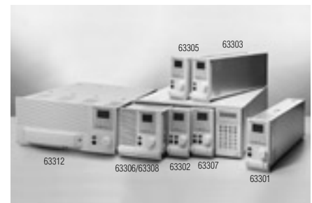
6330 Series High Speed DC Electronic Load Family