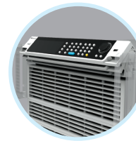
Front panel tilts for painfree viewing and operation on 7, 10 & 13U models

The NEW 63200A series of high power loads bring wider operating voltage and current ranges up to 480kW, sine wave loading, dynamic frequency sweep to 50kHz, digitizing, MPPT, an impressive front panel that tilts, and the highest accuracy available achieving 0.015%+0.015%F.S., 0.04%+0.04%F.S., and 0.1%+0.1%F.S. accuracy for voltage, current and power measurement respectively - all with an incredibly high power density (6kW @4U).