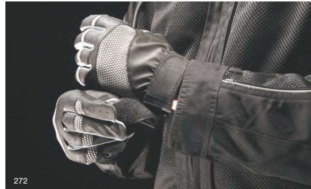
Sew to the fabric and leather of jackets and gloves.