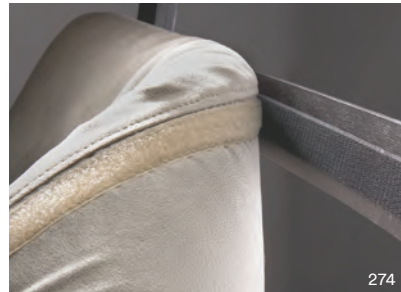
Attach removable seat cushions.