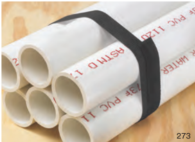
Use as a replacement for string, tapes, rubber bands, wire and strapping.