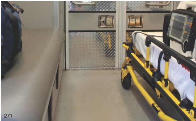
Attach cushioning panels in an ambulance or bus.