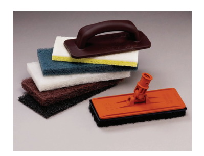
3M<sup>™</sup> Doodlebug<sup>™</sup> Pad Holders are versatile cleaning solutions.