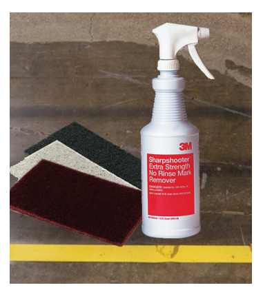
Scotch-Brite<sup>™</sup> Hand Pad 7447.

Thin backing provides excellent abrasion resistance and withstands lifting from forklift traffic and dragging pallets. Vibrant color is locked into the backing for long-term visibility. Easy to apply and remove.