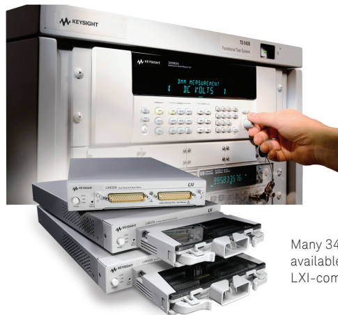
Many 34980A modules are available in a standalone, LXI-compliant form factor