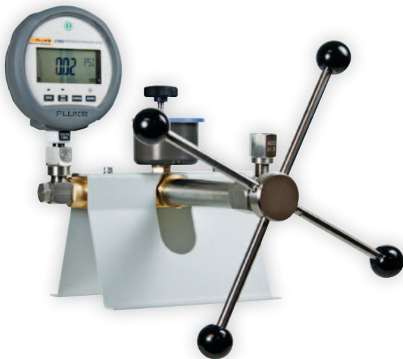
Combine the 2700G gauge with the P5510, P5513, P5514 (shown here) or P5515 Comparison Test Pumps for a complete bench top pressure calibration solution.

The 2700G Reference Pressure Gauges provide best-in-class measurement performance in a rugged, easy-to-use, economical package. Improved measurement accuracy allows it to be used for a wide variety of applications. It is ideal for calibrating pressure measurement devices such as pressure gauges, transmitters, transducers, and switches. In addition, it can be used as a check standard or to provide process measurements with data logging.